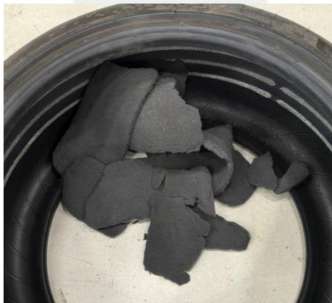
Figure 1 – Loose NVH foam inside tire