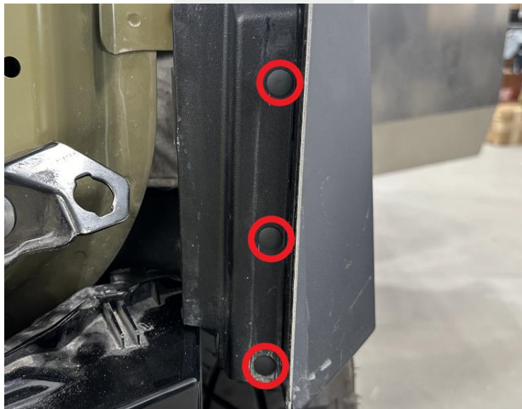
Figure 3 - LH shown; RH similar