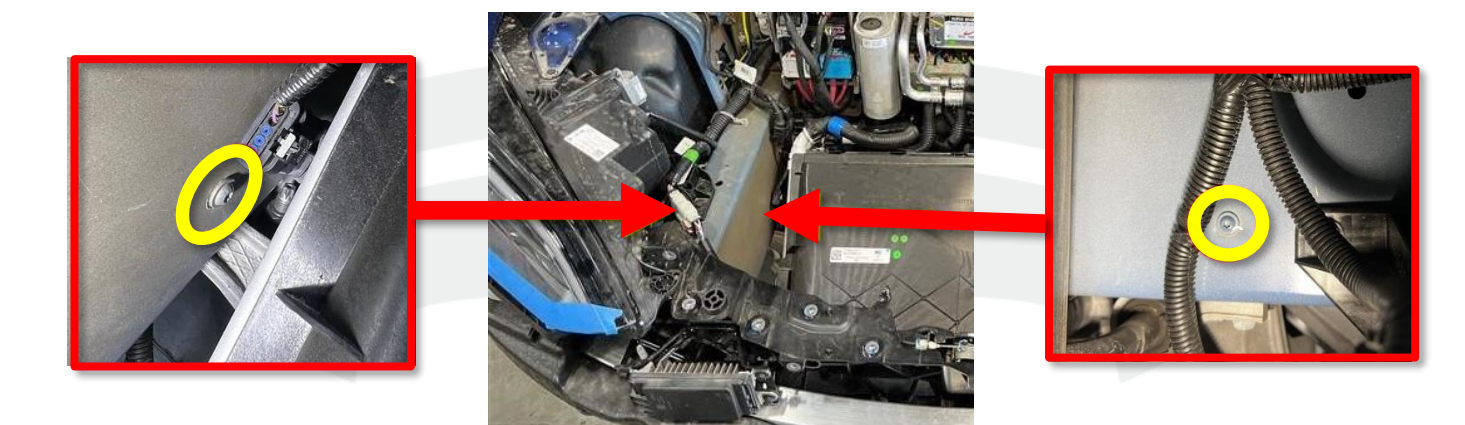
Figure 1 – Bolt locations, RH front frame rail

Tighten the T25 bolts (x2) that attach the inner and outer threaded inserts on the RH front frame rail (Figure 1) (torque 7 Nm).