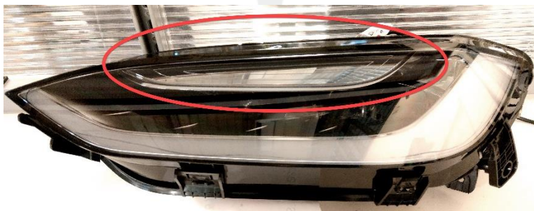
Figure 1 (Base level headlights)